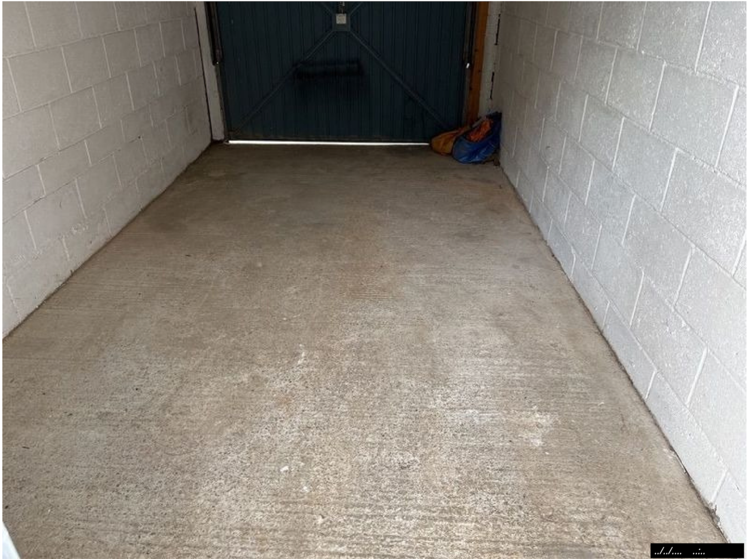
Ref # 1.11