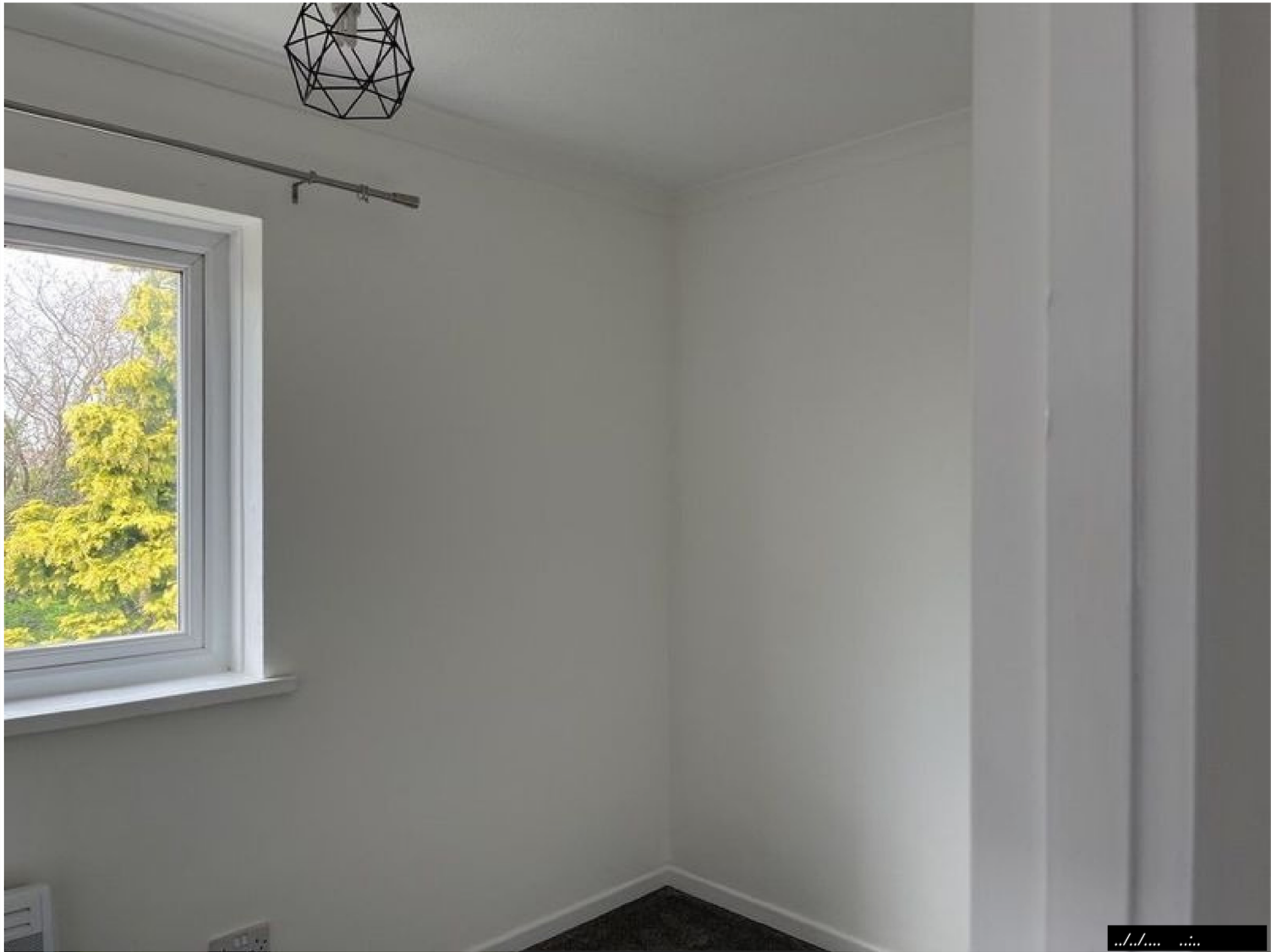
Ref # 1.7