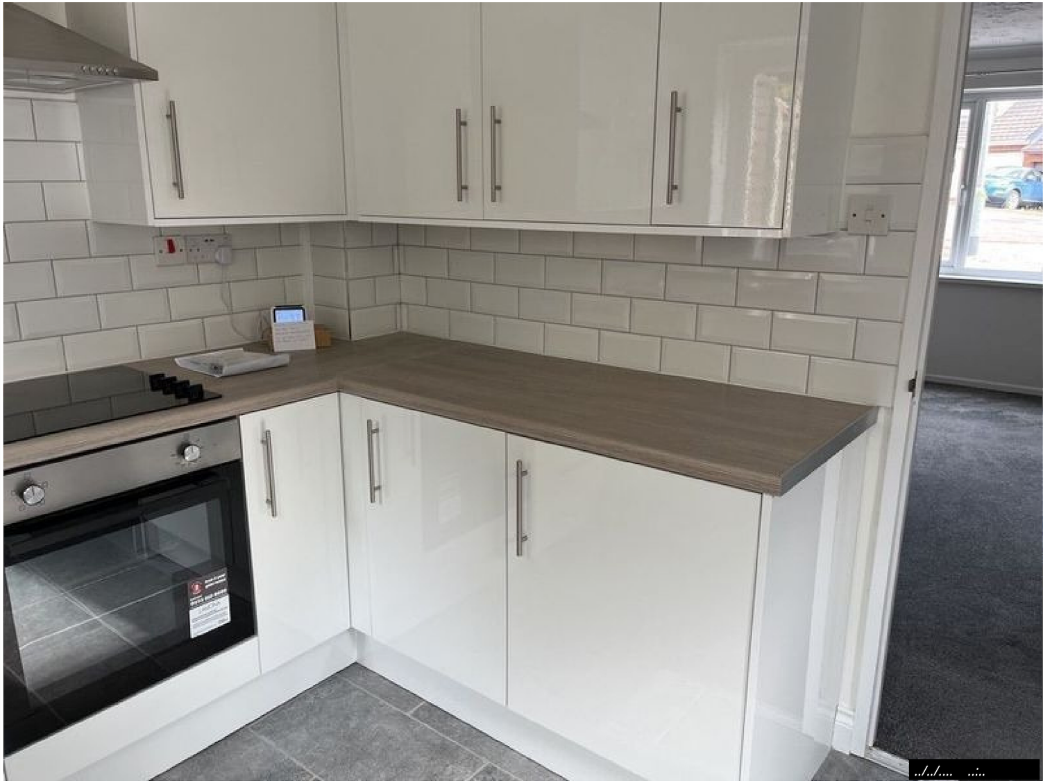
Ref # 1.3