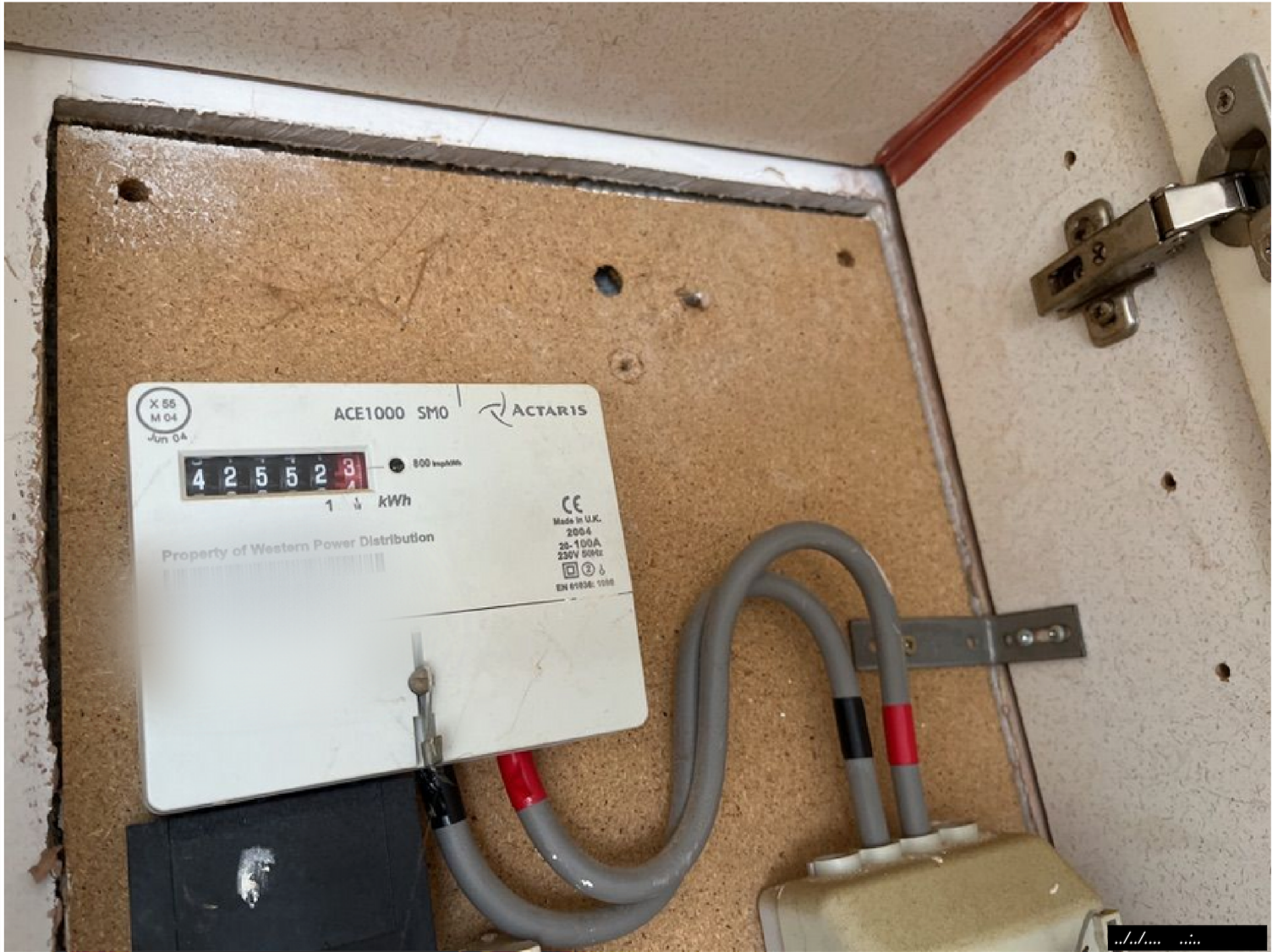
Ref # 2.2