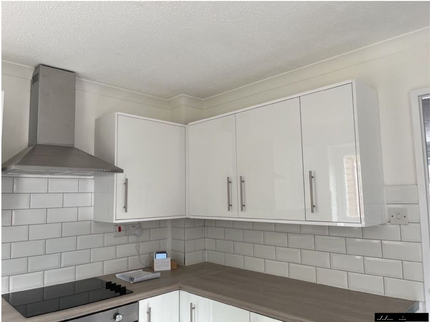
Ref # 1.3