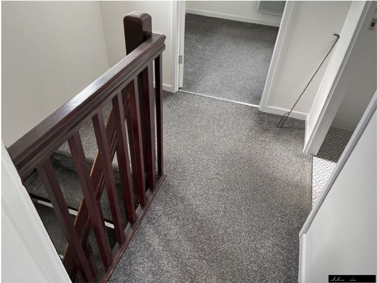
Ref # 1.5