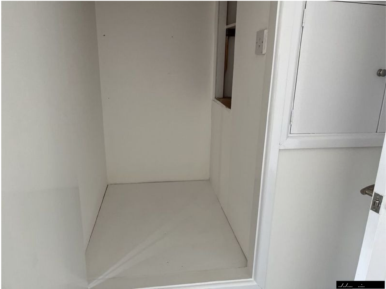
Ref # 1.6