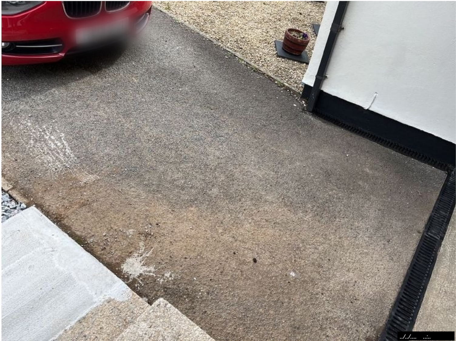
Ref # 1.10