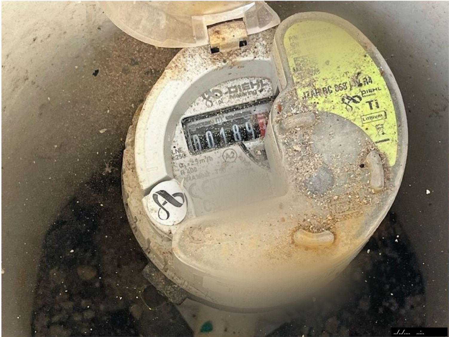
Ref # 2.3