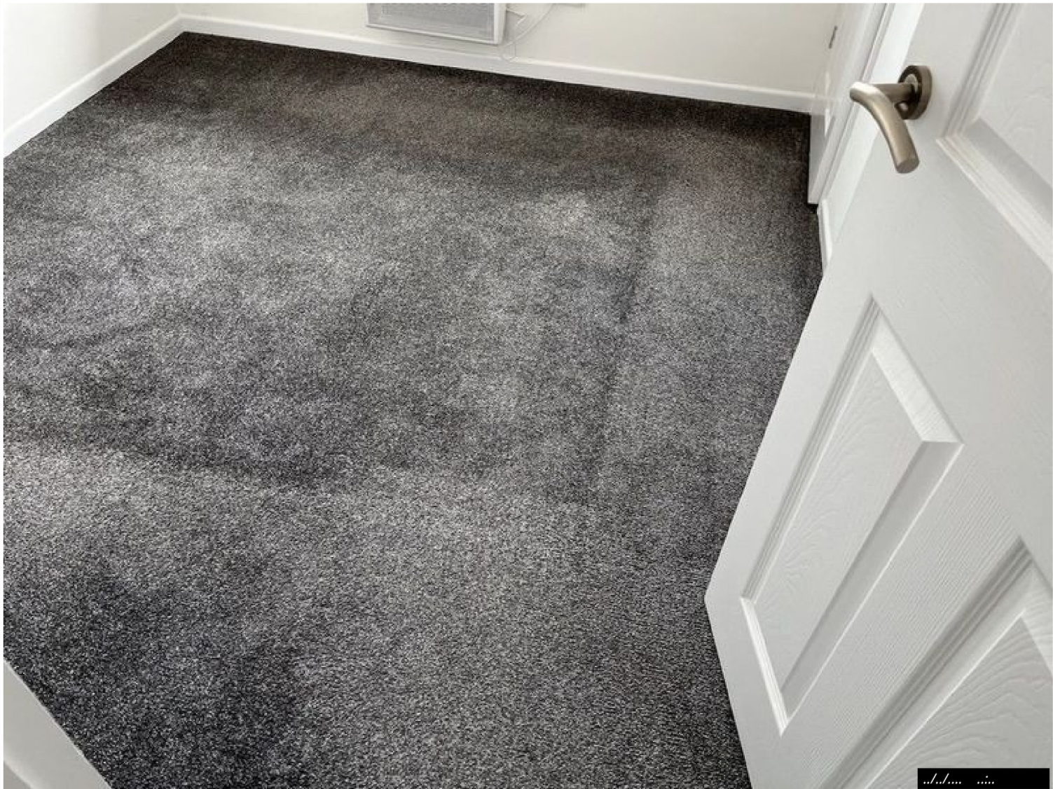
Ref # 1.6