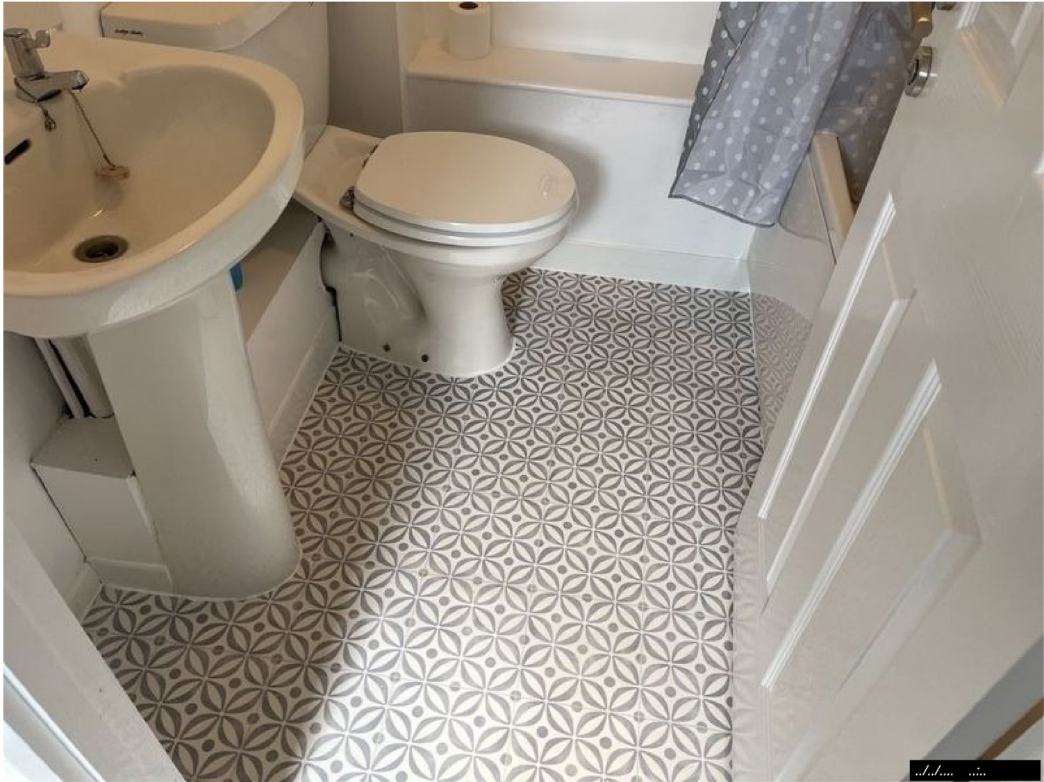
Ref # 1.8