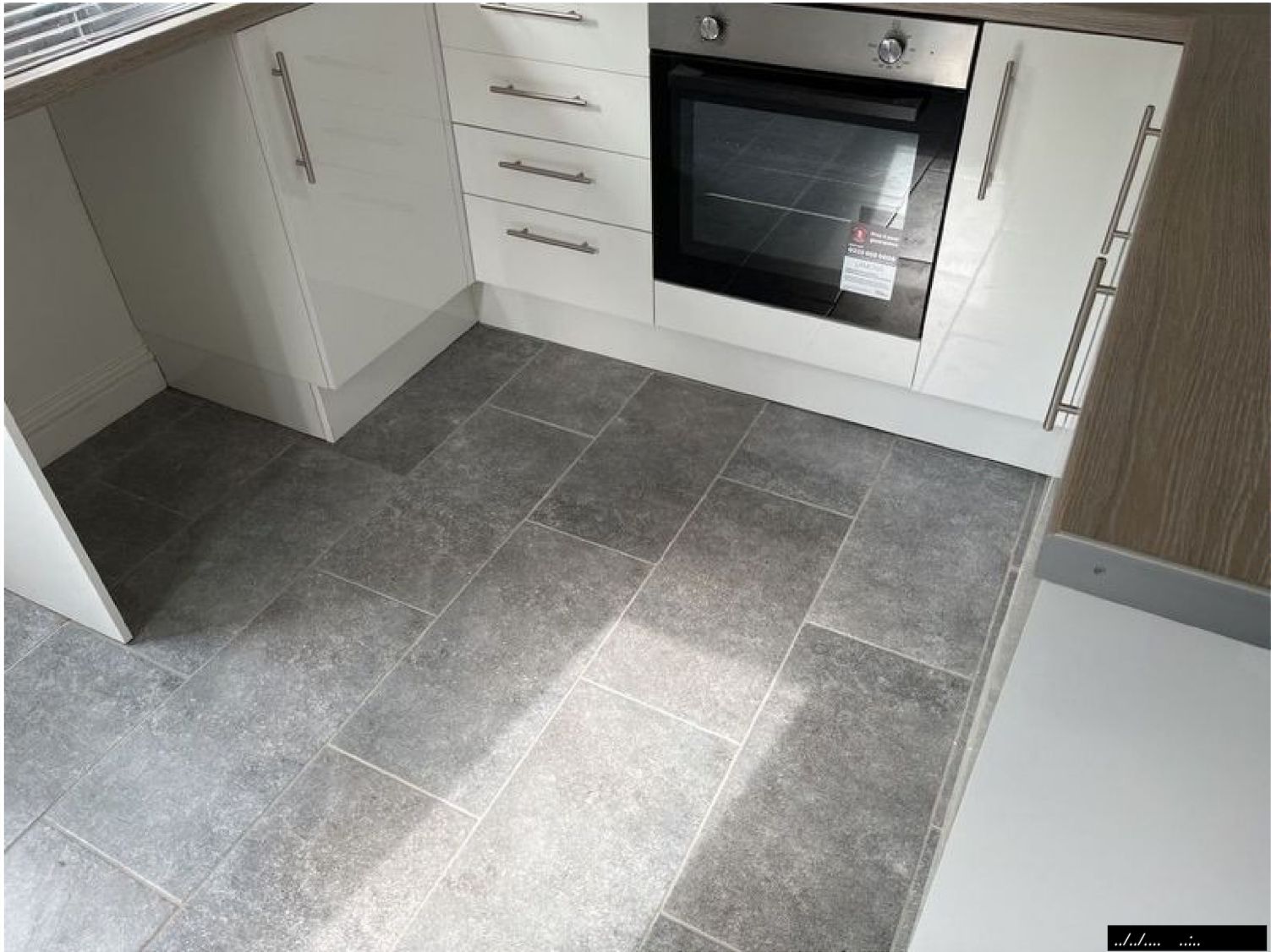
Ref # 1.3