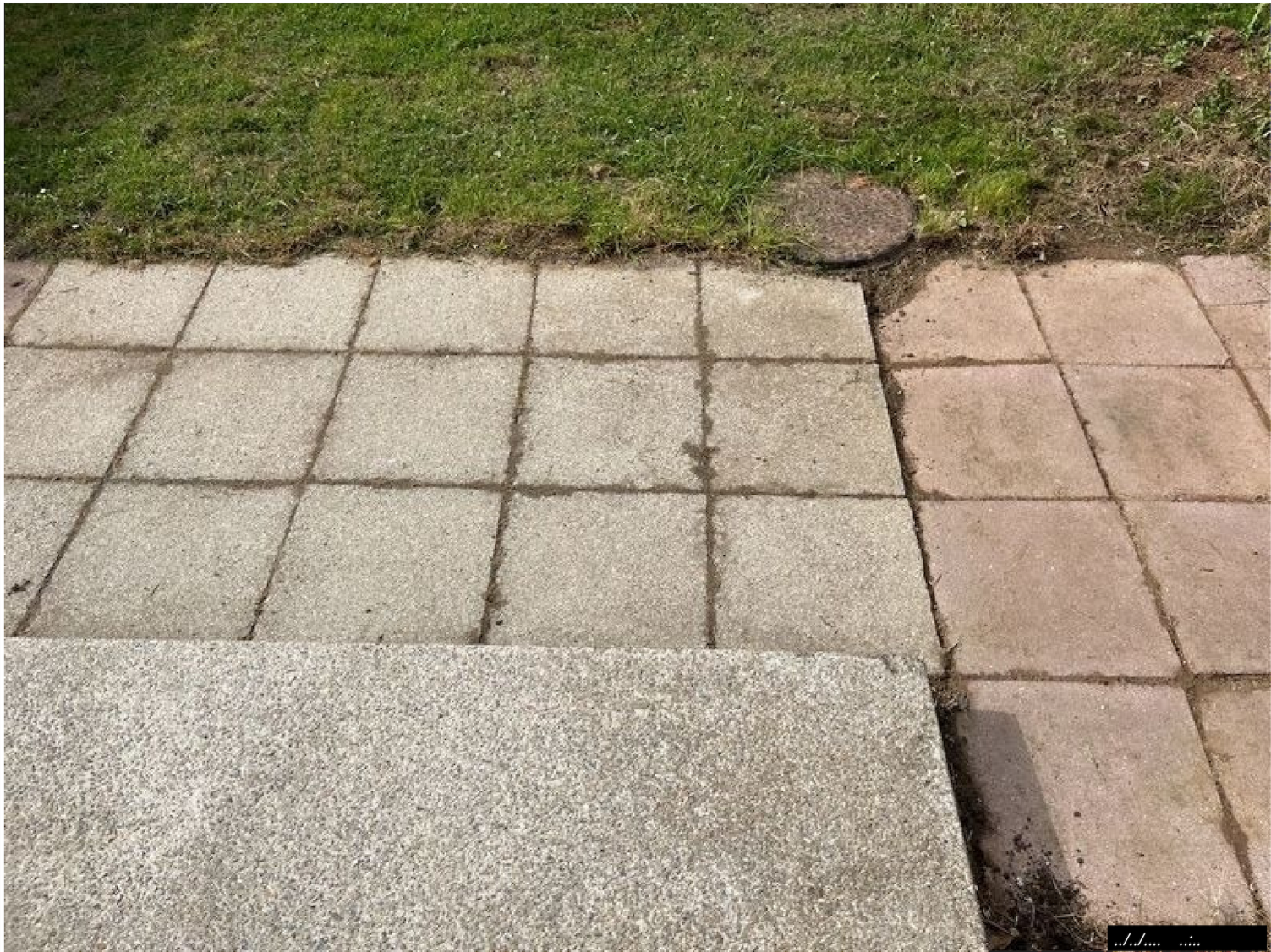
Ref # 1.9