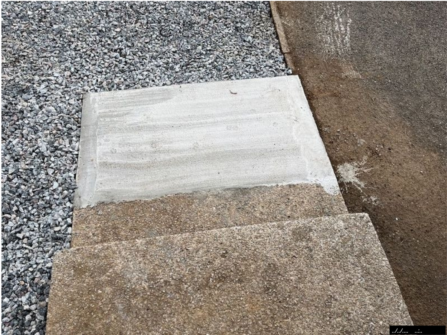
Ref # 1.10