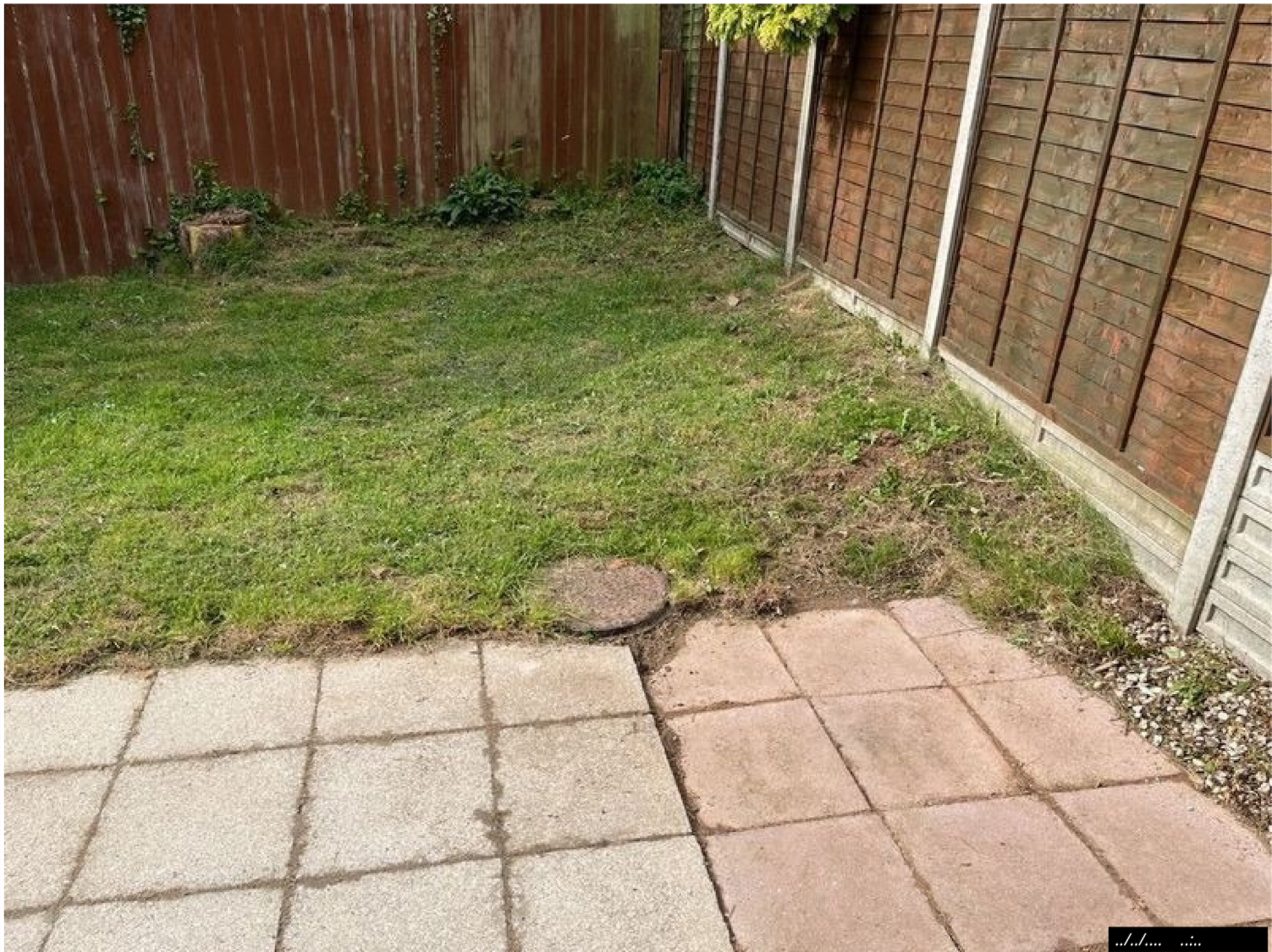
Ref # 1.9