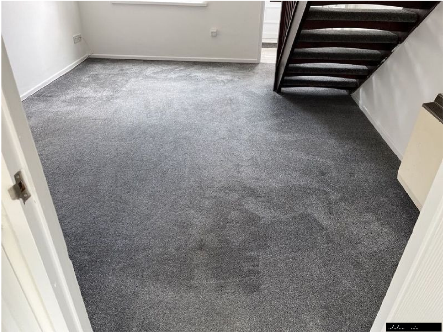
Ref # 1.2