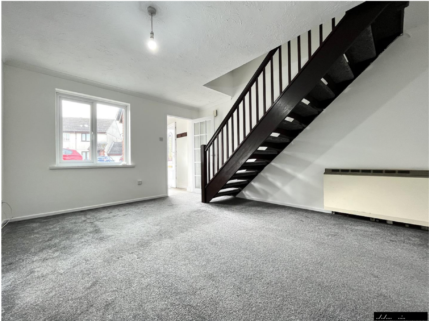
Ref # 1.2