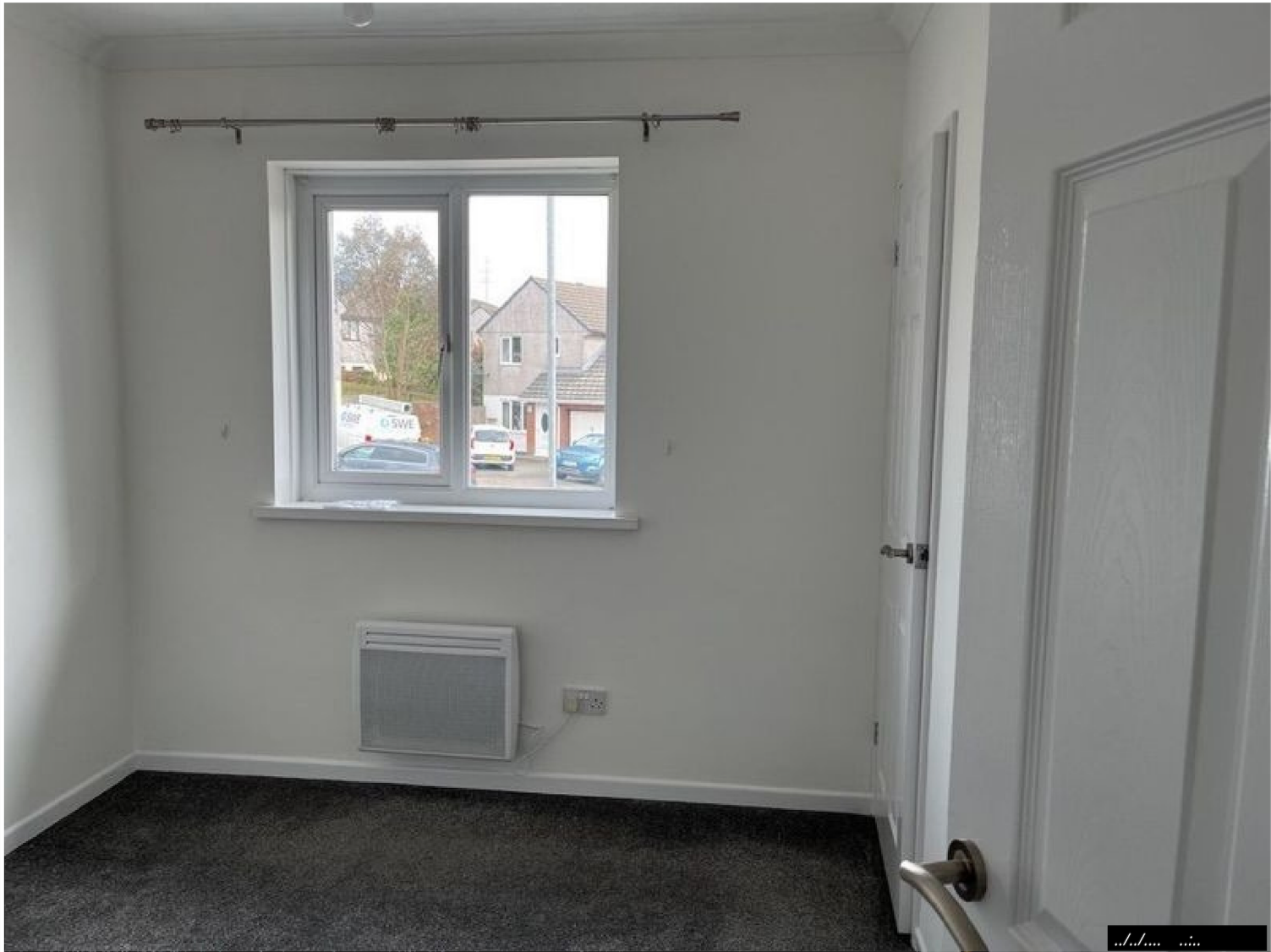
Ref # 1.6