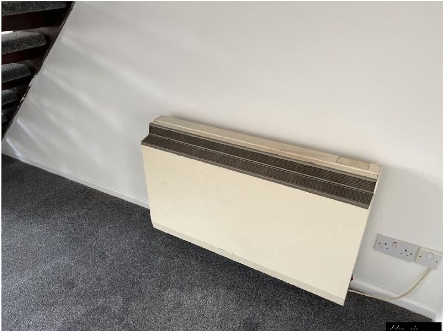
Ref # 1.2