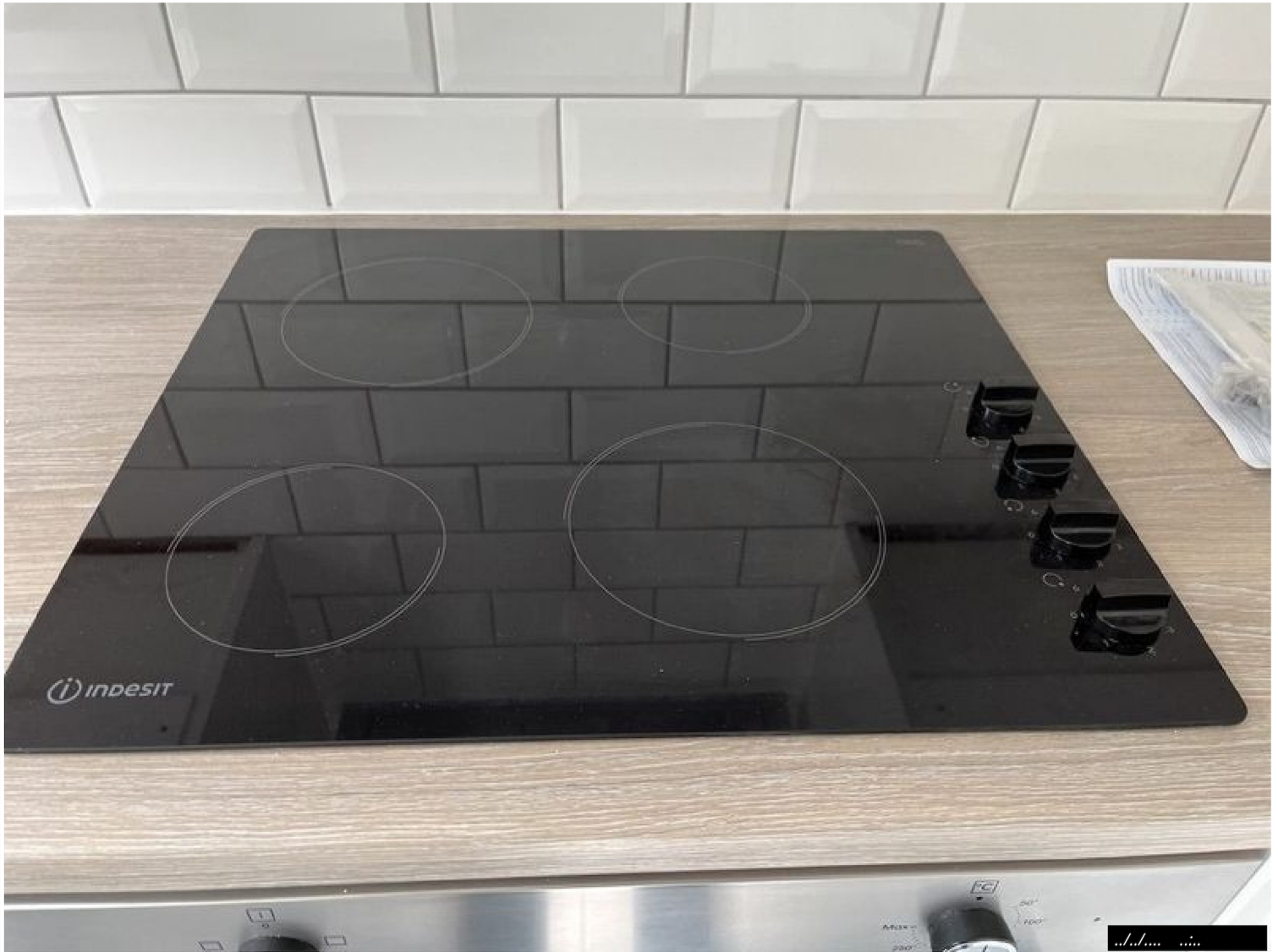
Ref # 1.3