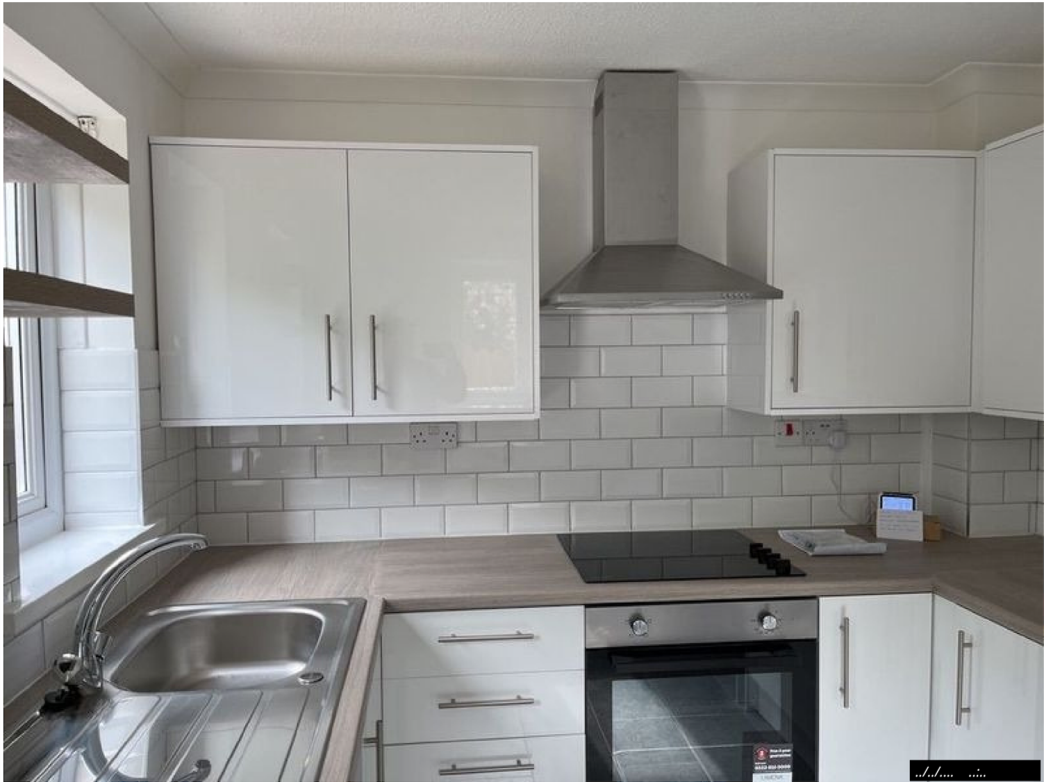
Ref # 1.3