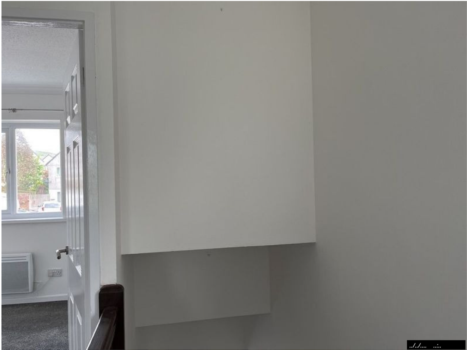
Ref # 1.4