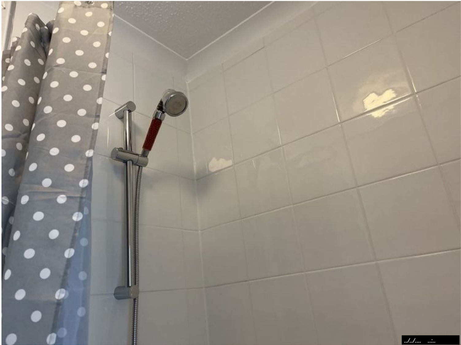
Ref # 1.8