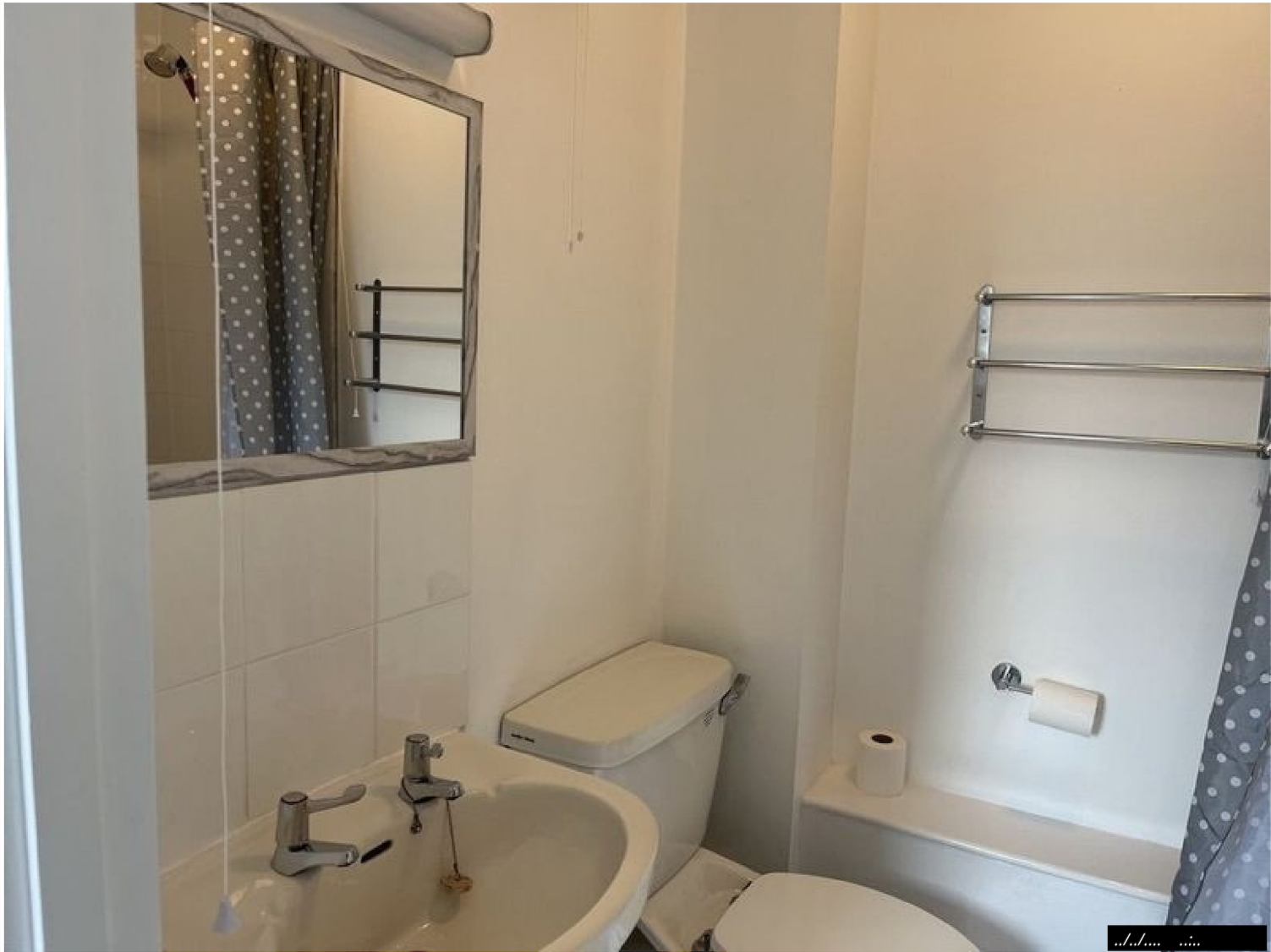
Ref # 1.8