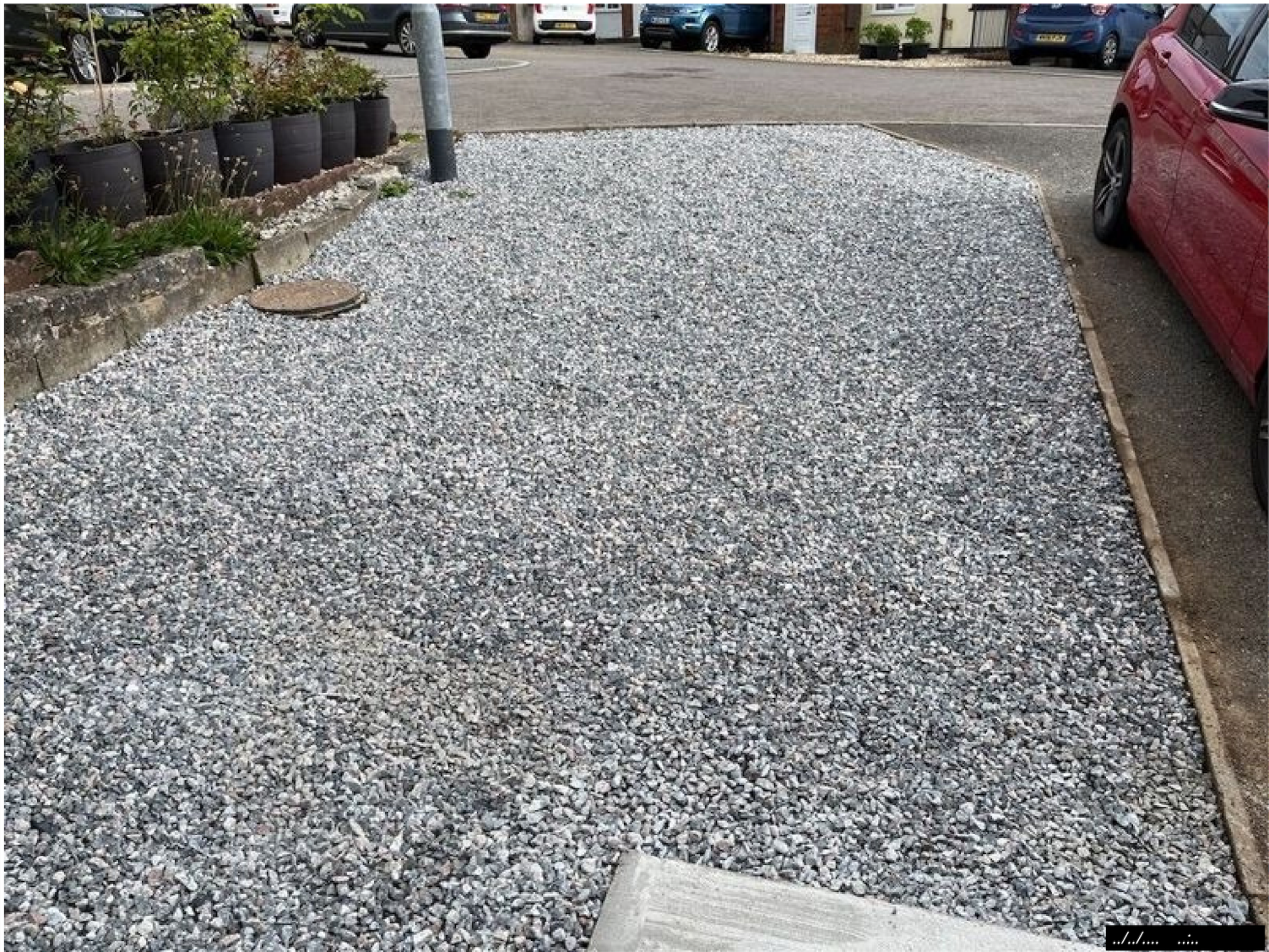
Ref # 1.10