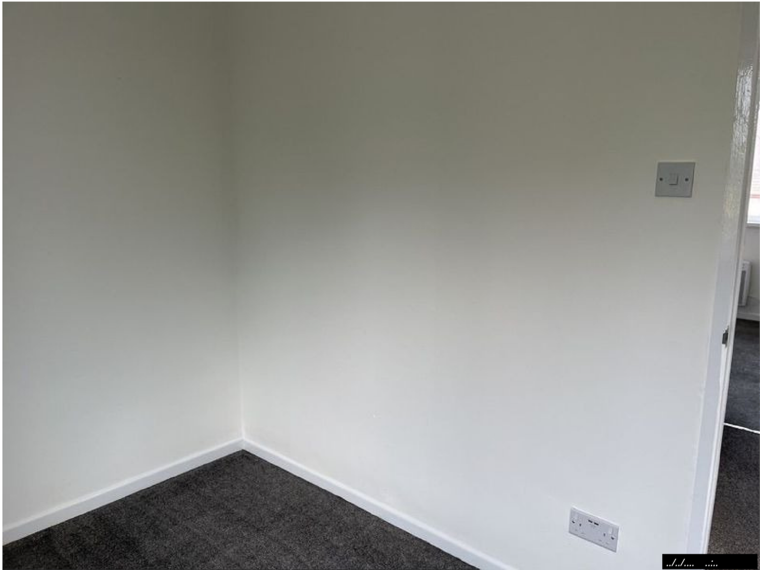
Ref # 1.7