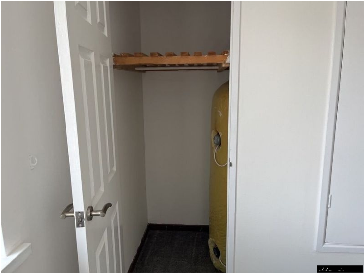
Ref # 1.6