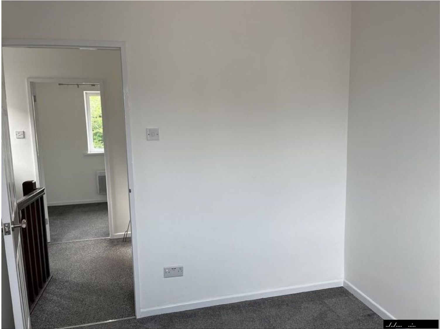
Ref # 1.6