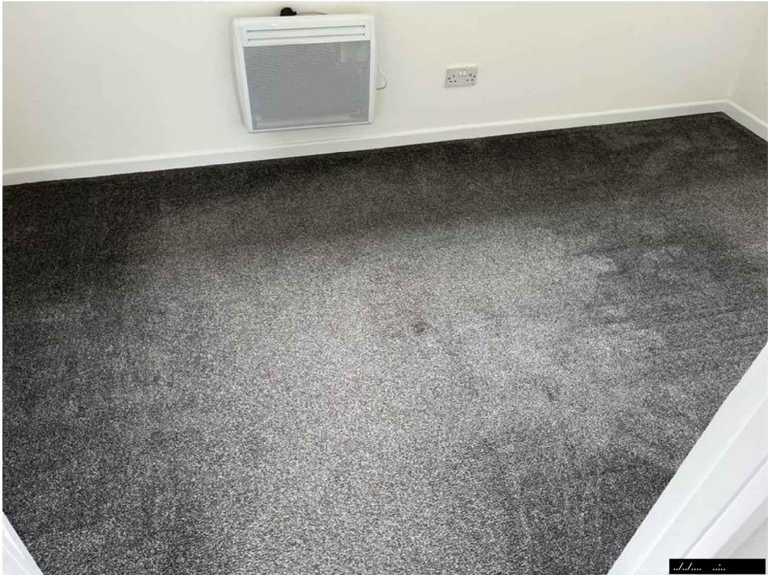
Ref # 1.7