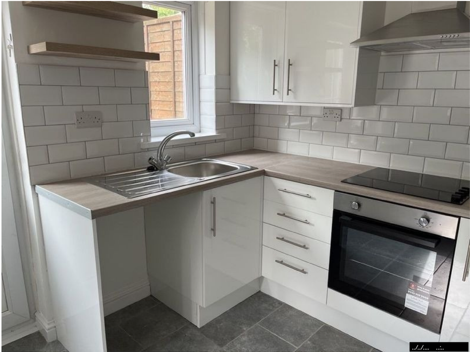
Ref # 1.3