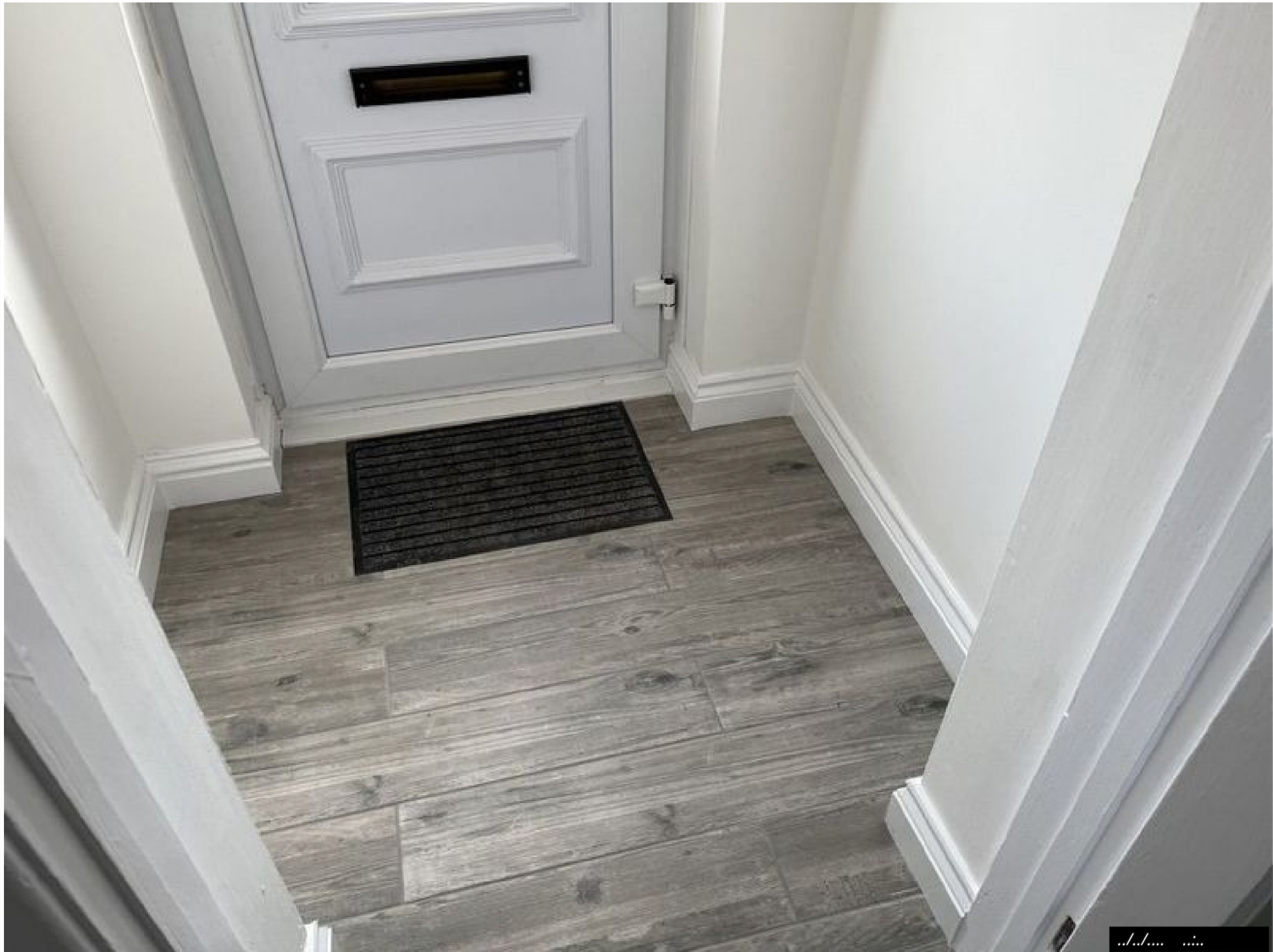
Ref # 1.1