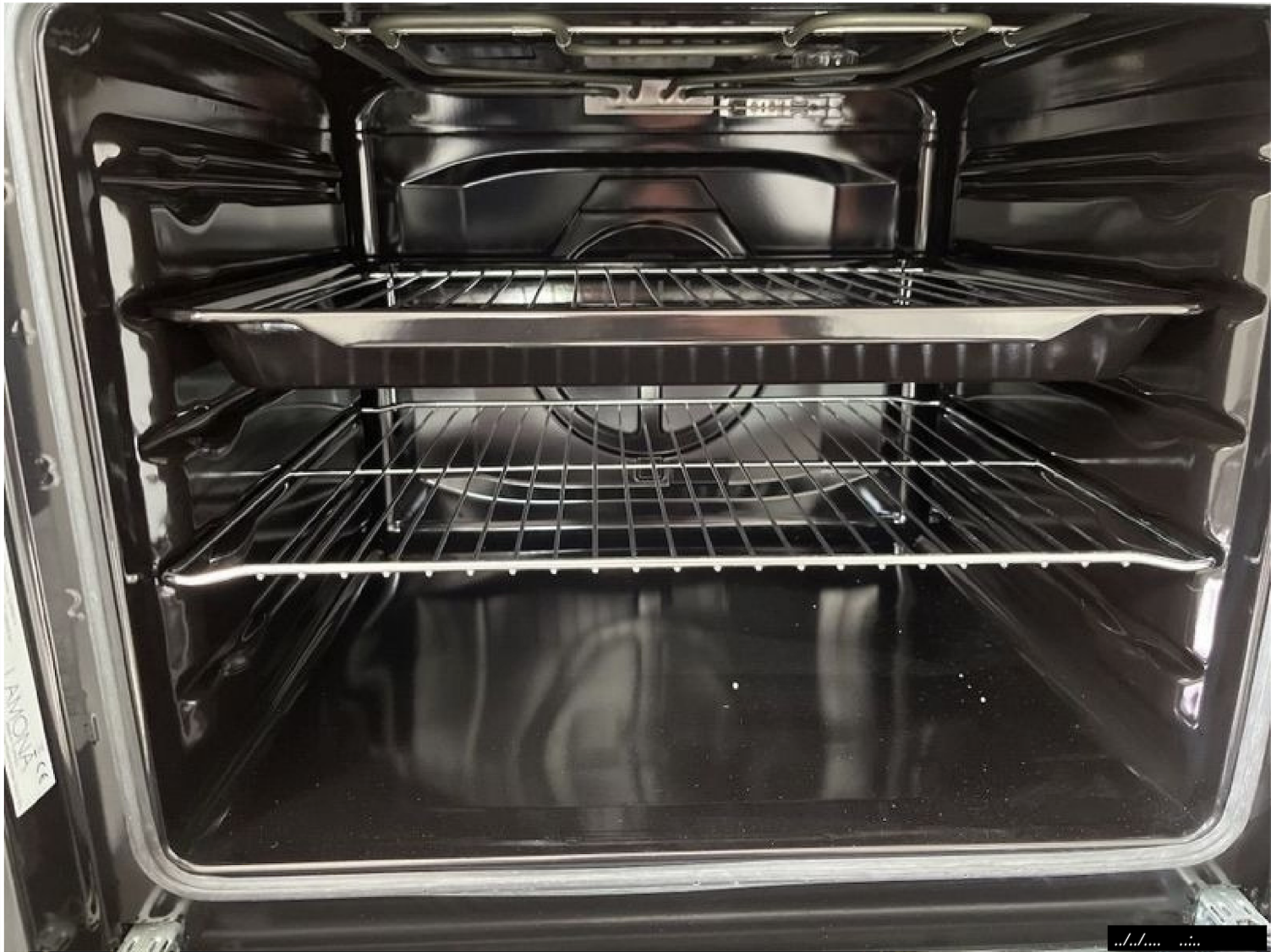
Ref # 1.3