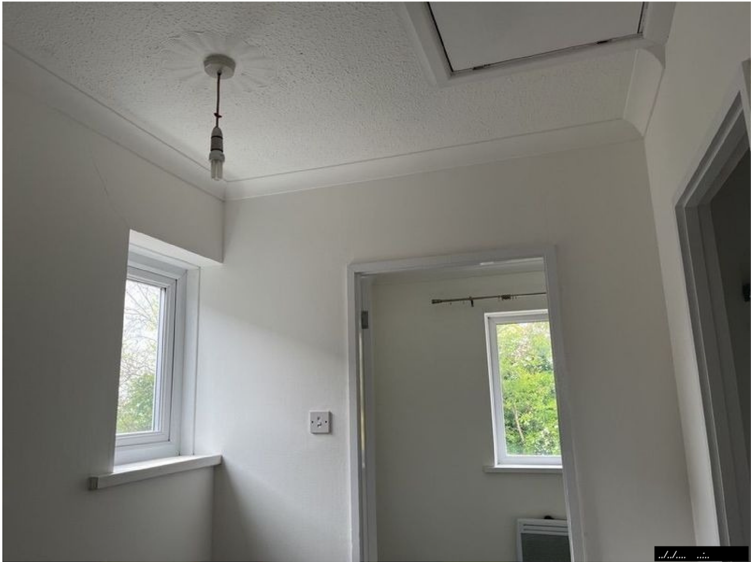
Ref # 1.5