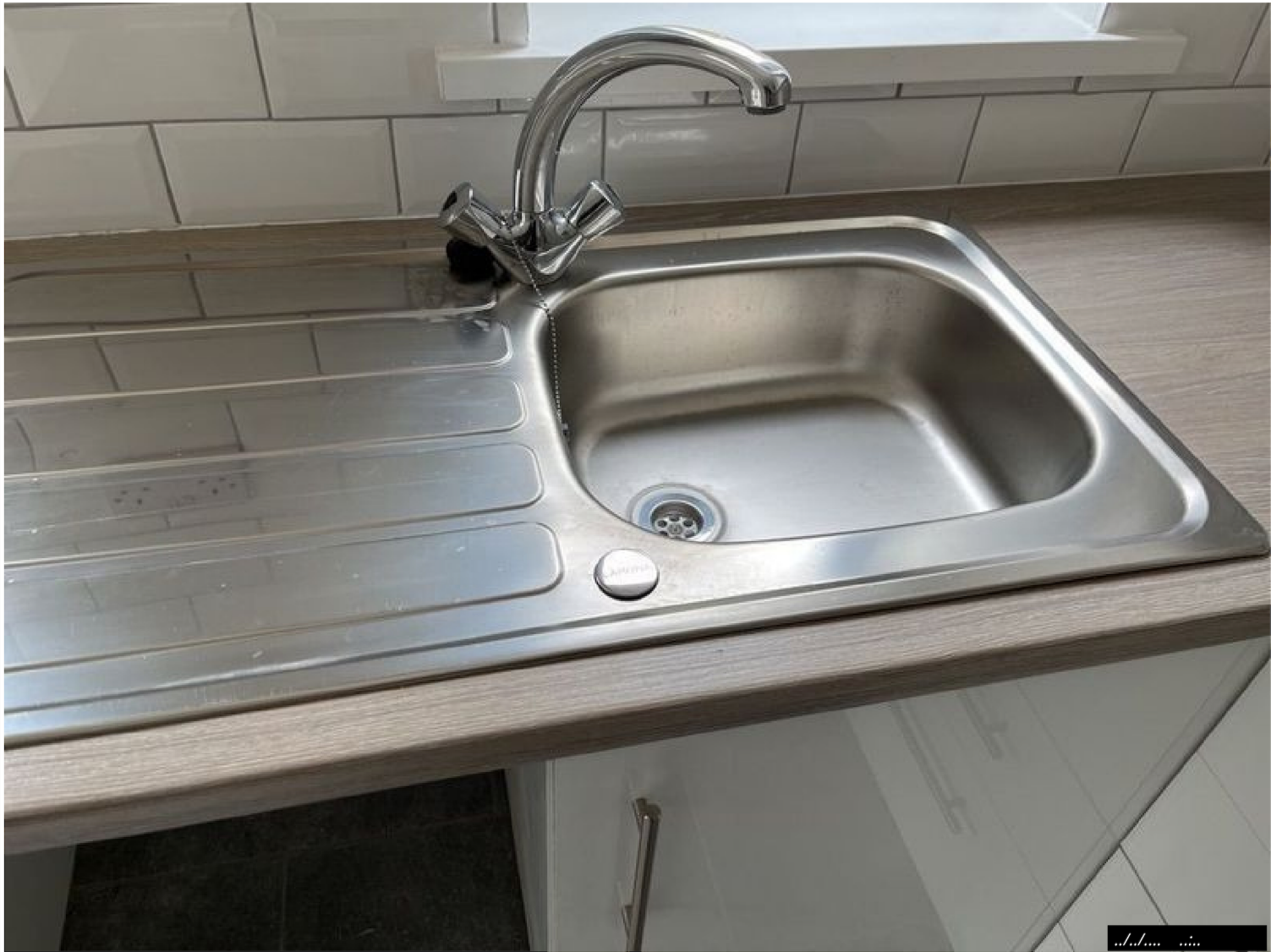
Ref # 1.3