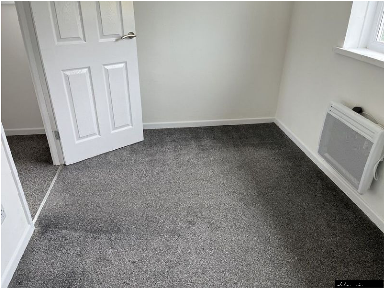
Ref # 1.7