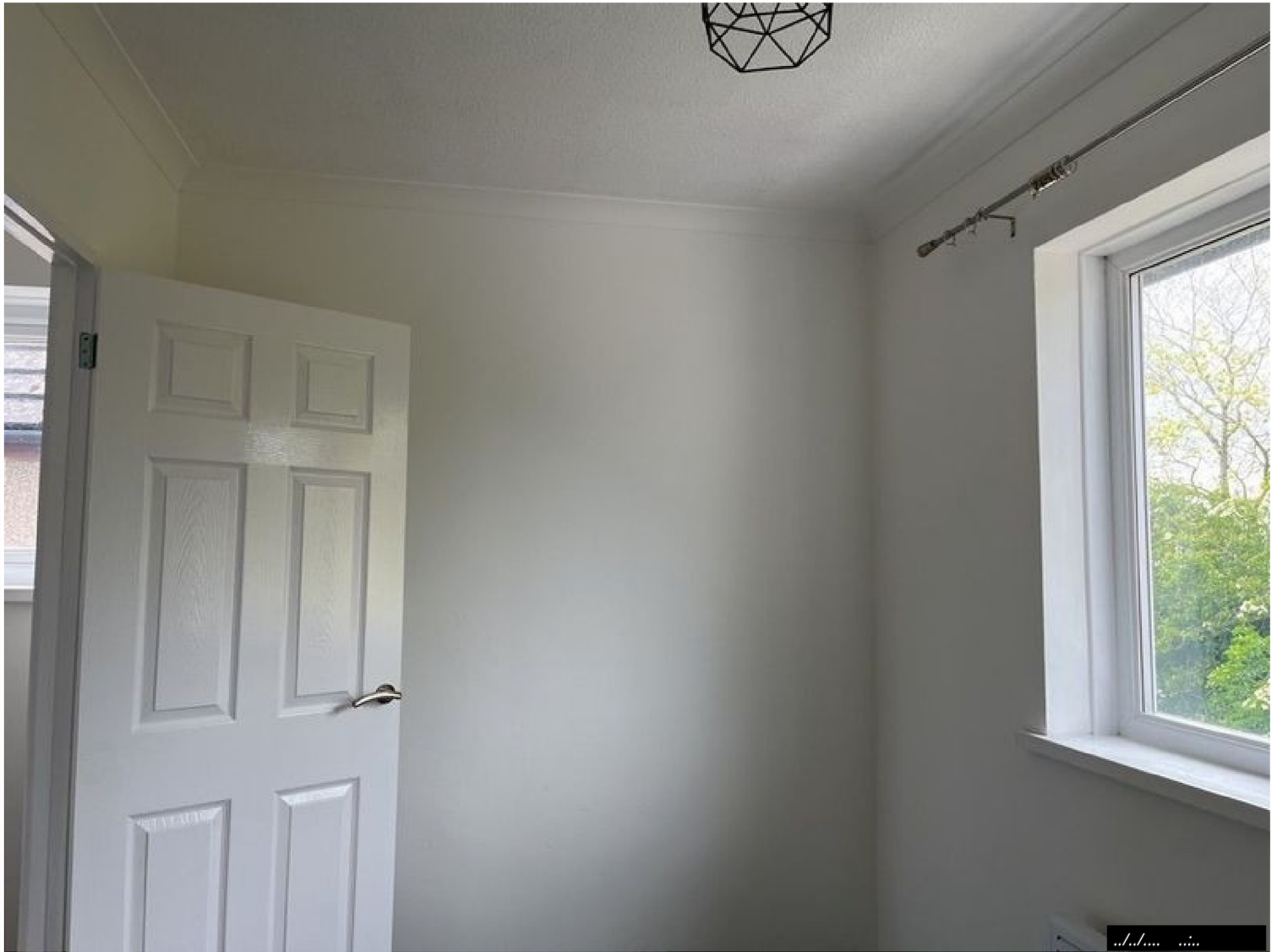
Ref # 1.7