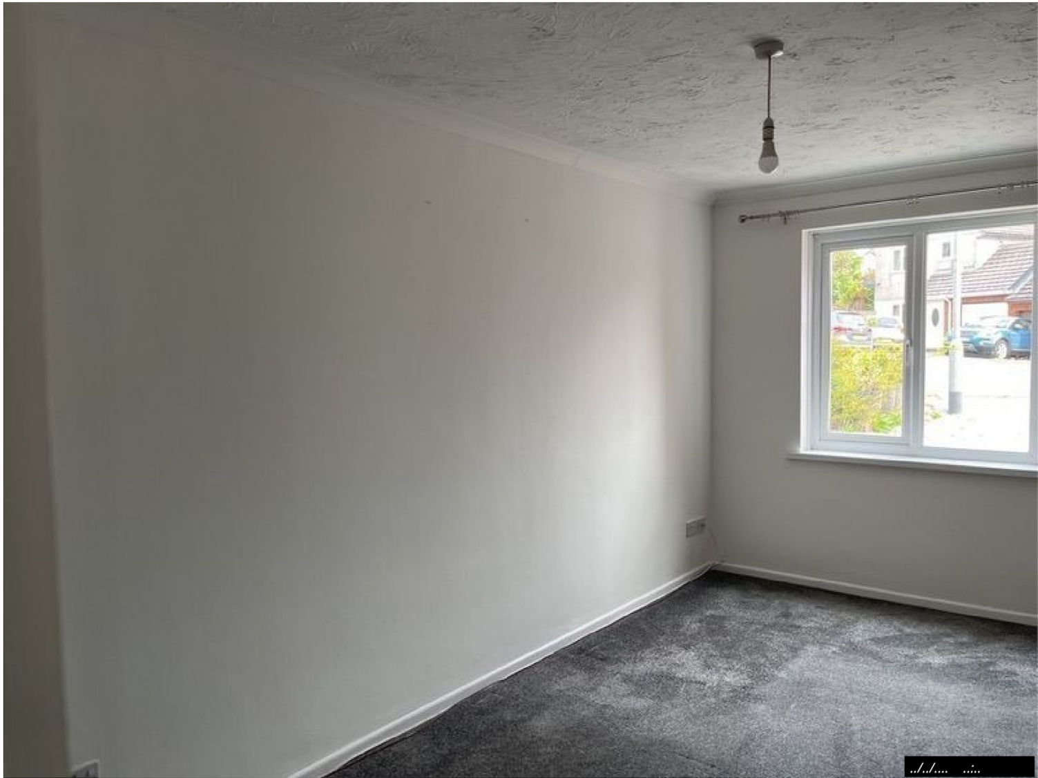
Ref # 1.2