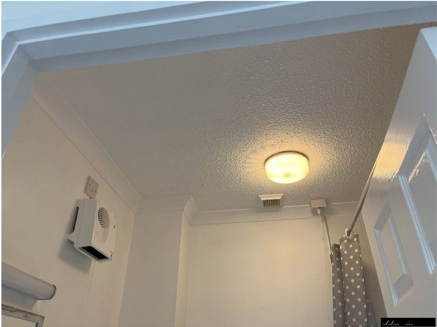
Ref # 1.8