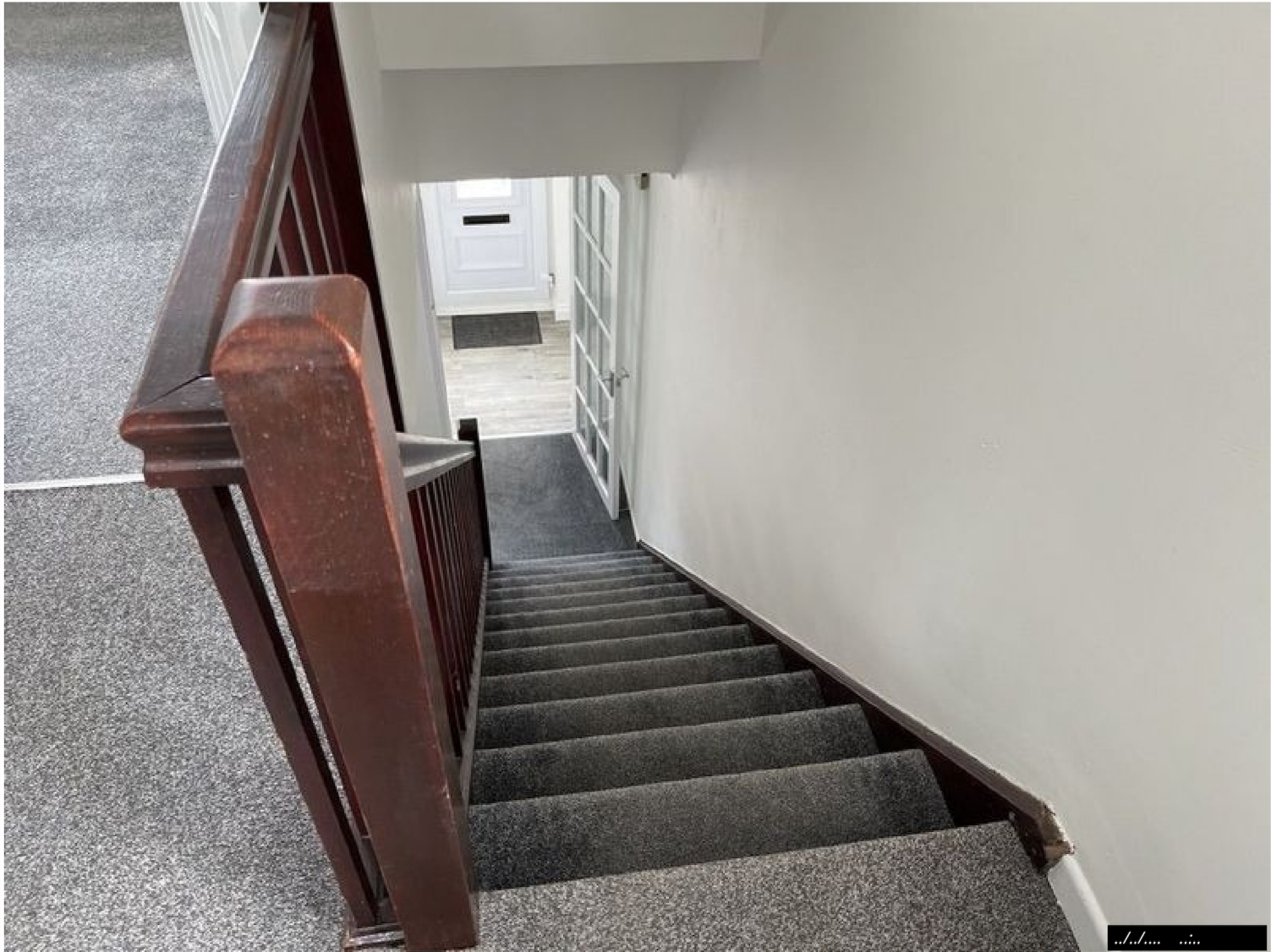
Ref # 1.4