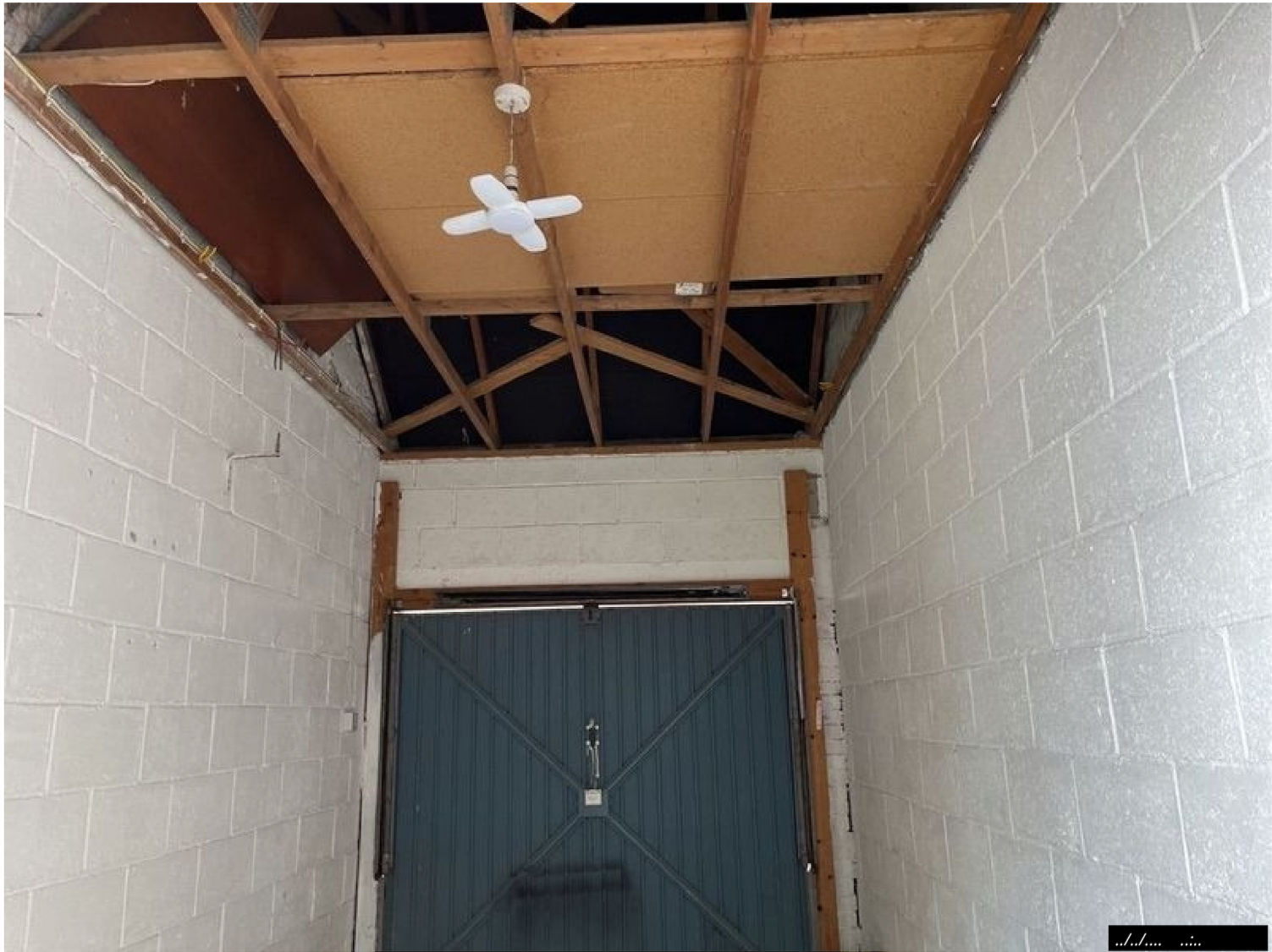
Ref # 1.11