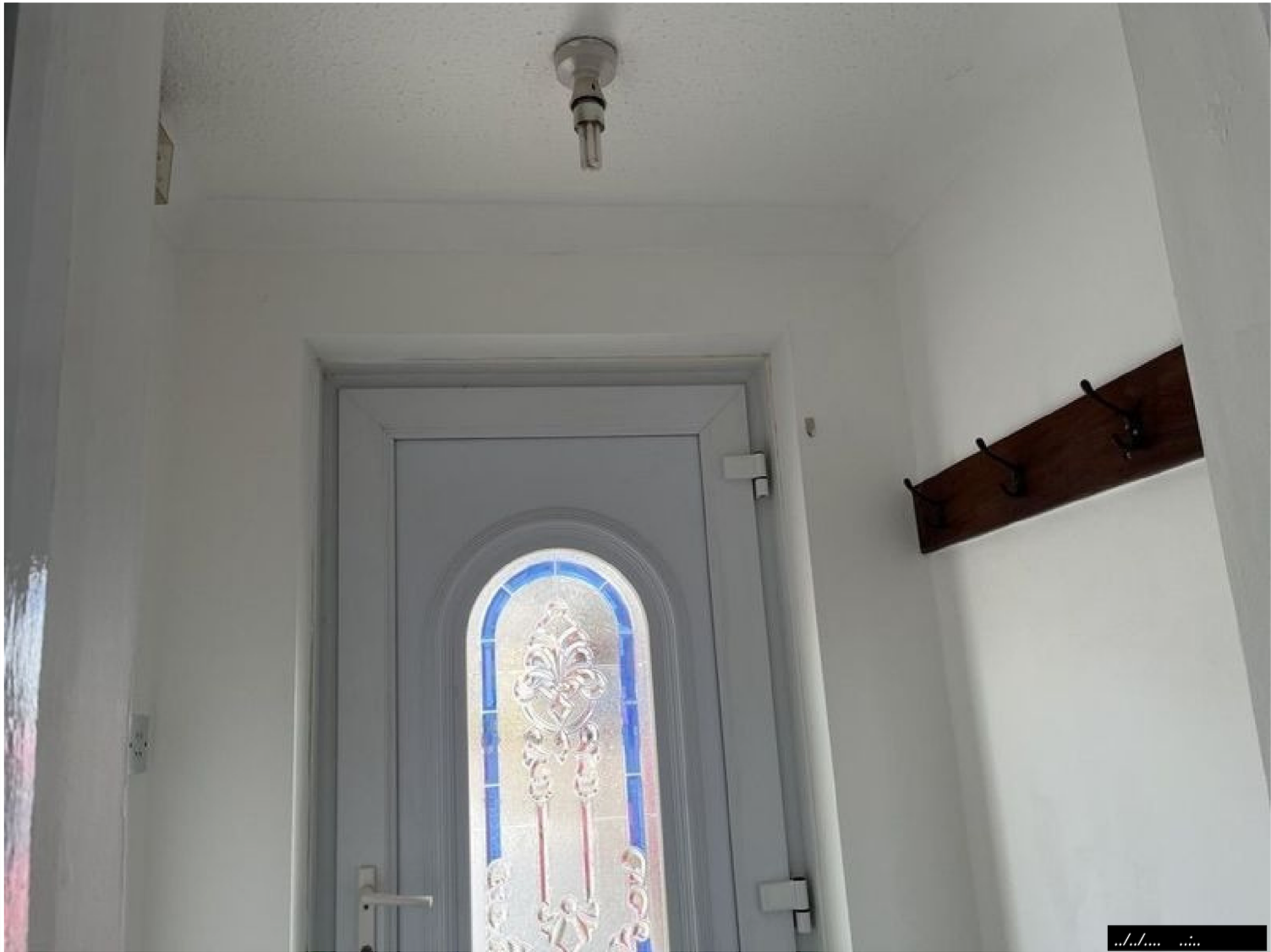
Ref # 1.1