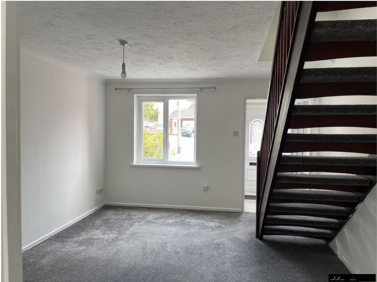
Ref # 1.2