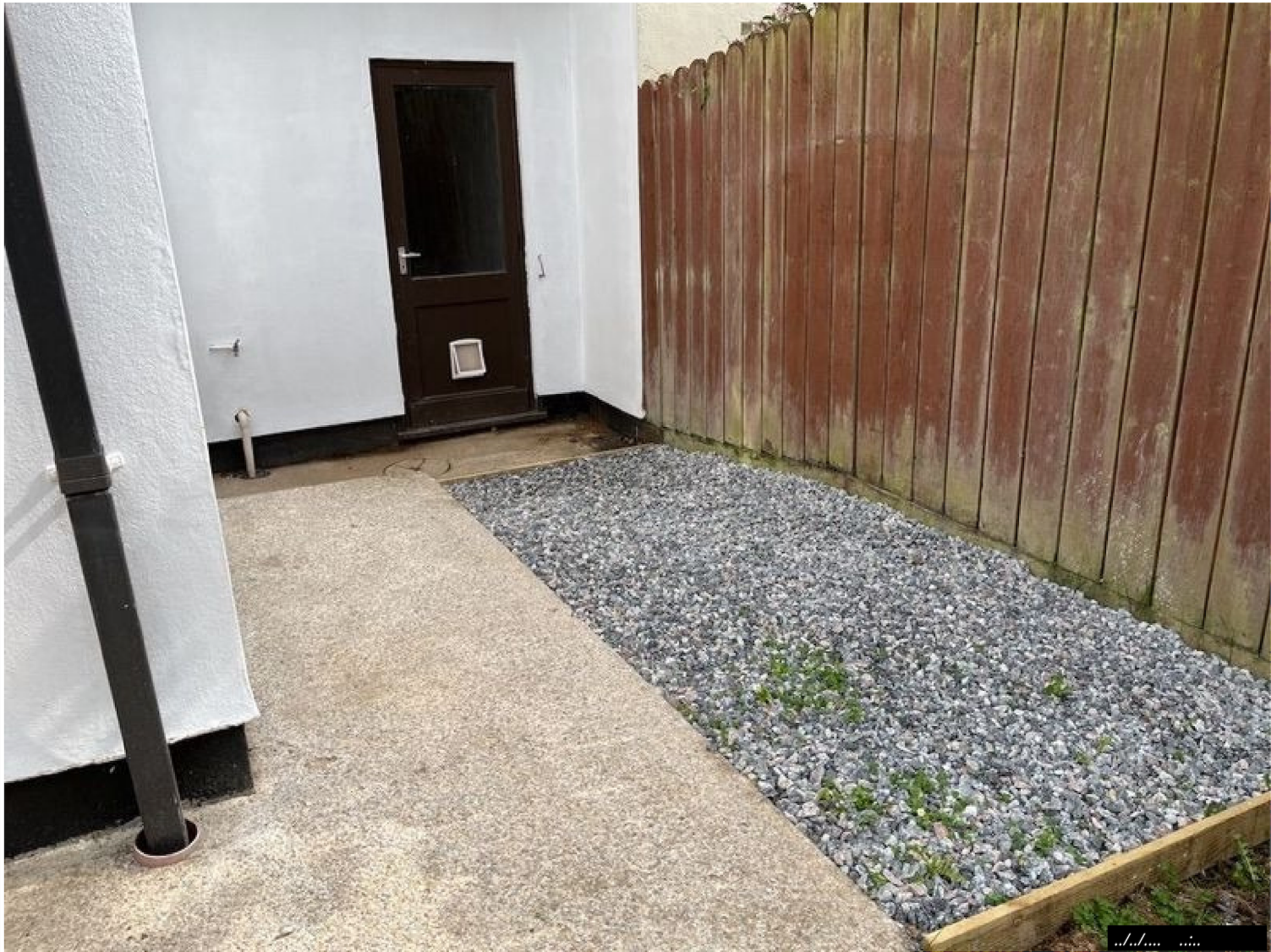
Ref # 1.9