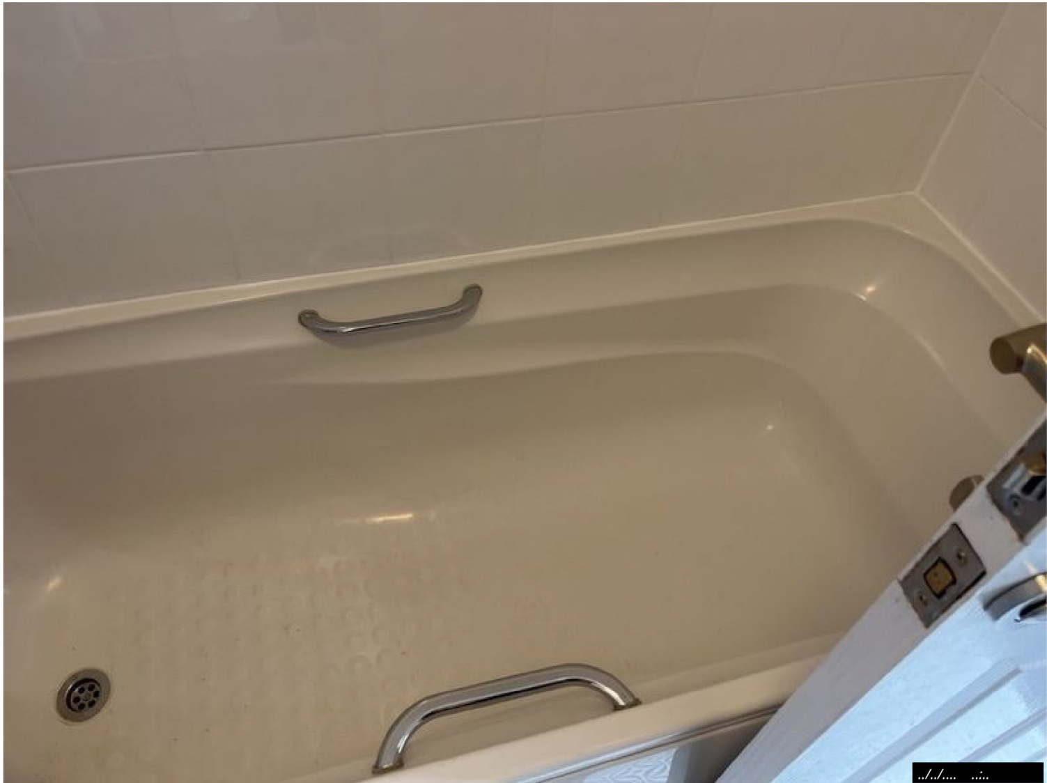
Ref # 1.8