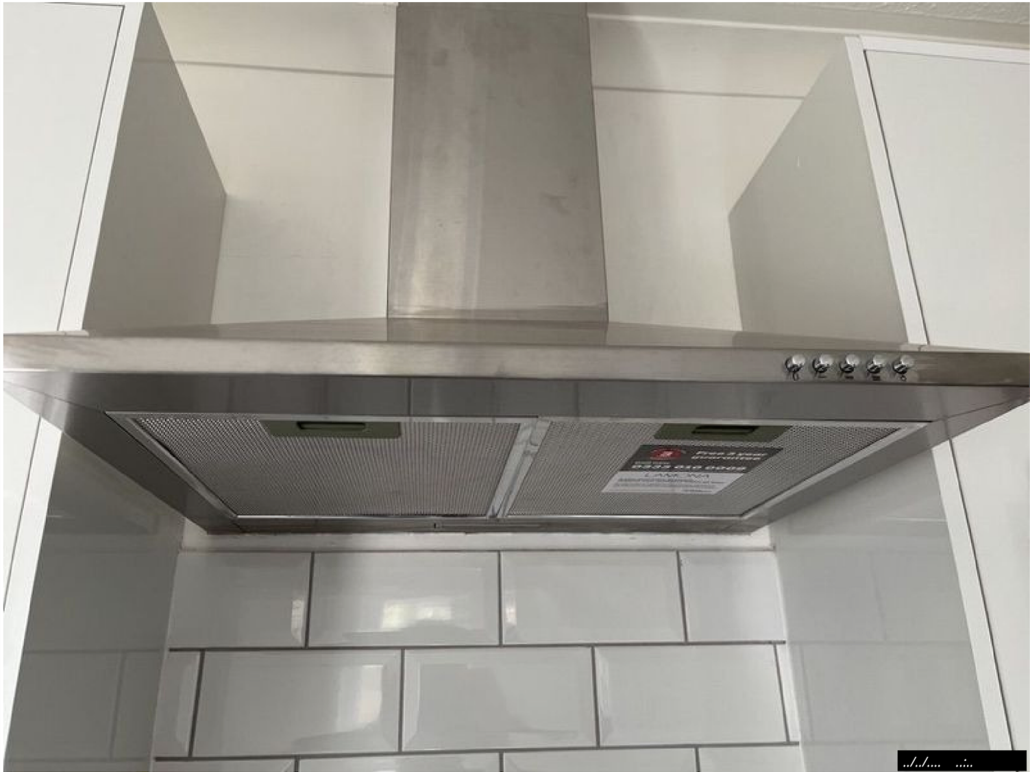
Ref # 1.3