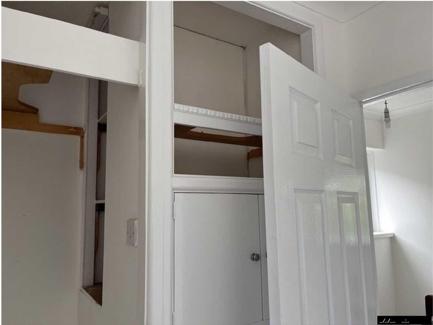
Ref # 1.6