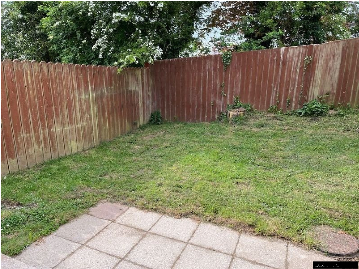
Ref # 1.9