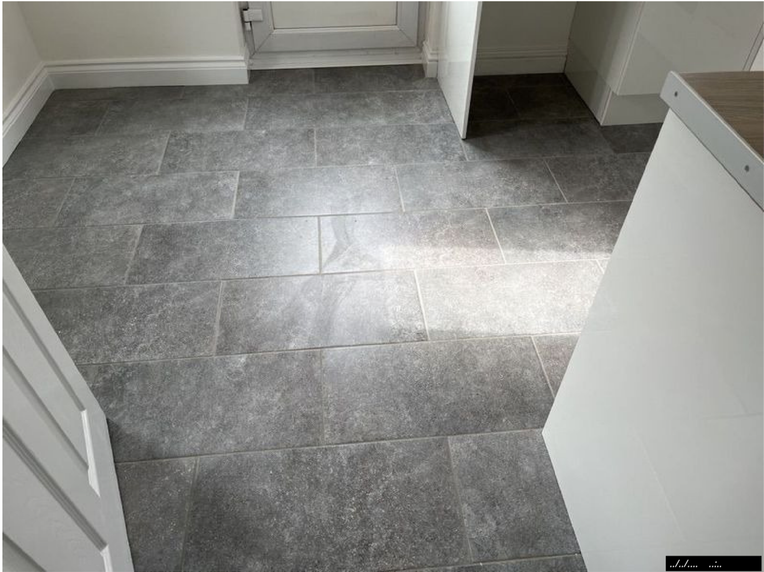
Ref # 1.3