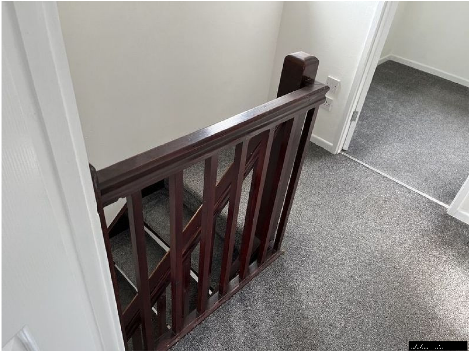
Ref # 1.5